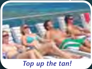
Top up the tan!