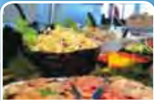
Sumptuous buffet lunch