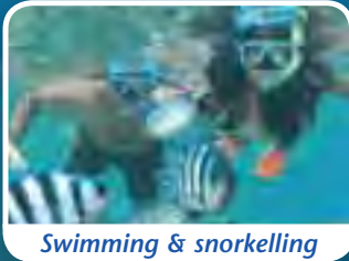
Swimming & snorkelling