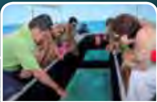
Glass bottom boat