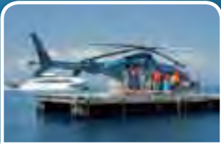
Heli - Scenic & Fly/Cruise