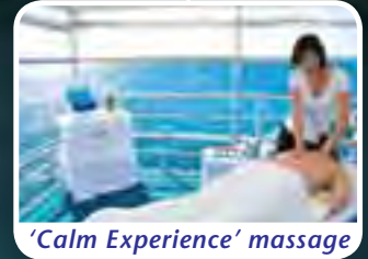
'Calm Experience' massage