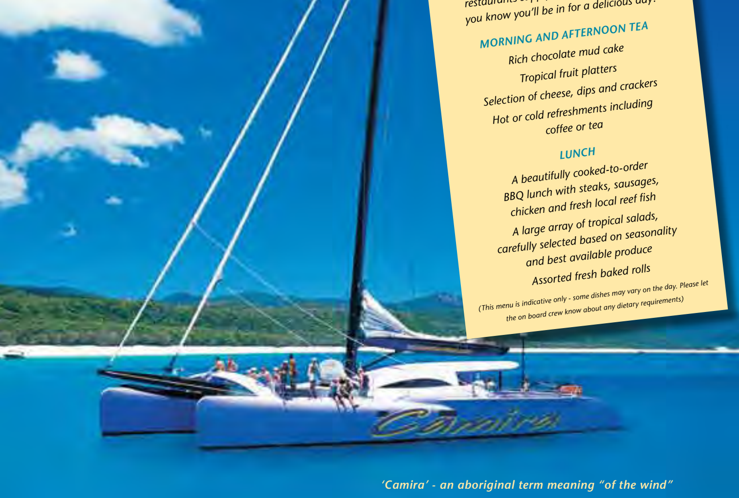
'Camira' - an aboriginal term meaning "of the wind"

(This menu is indicative only - some dishes may vary on the day. Please let the on board crew know about any dietary requirements)