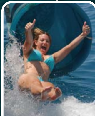
Waterslide - Yeeha!