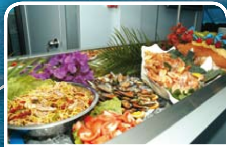
Sumptuous buffet lunch