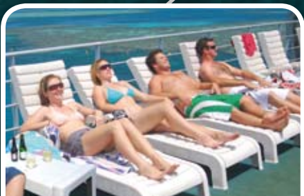
Top up the tan!