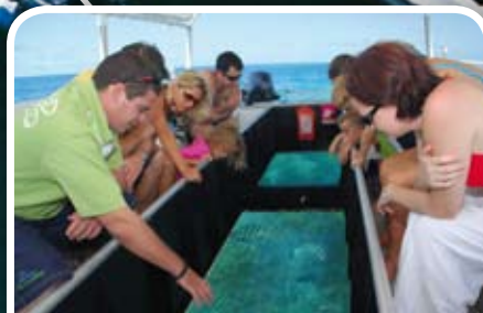
Glass bottom boat

All photos in this brochure are taken at Knuckle Reef Lagoon