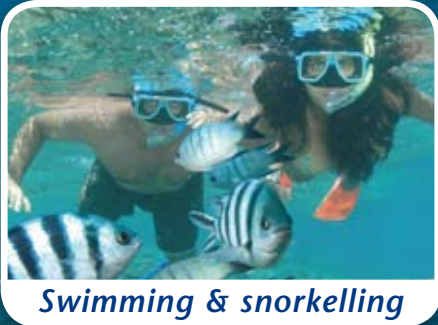
Swimming & snorkelling