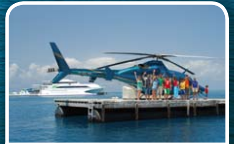
Helicopter scenic flights